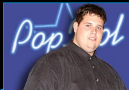
Burger or skinny latte?

Contrary to what most people think there is no legal requirement to label foods with nutritional values anyway. Some products do and some don't. Even for those products declaring information