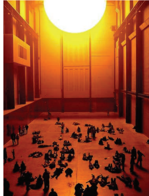
The Weather Project by Olafur Eliasson, an exhibition @ Tate Britain

Each day consisted of an introductory interactive talk, gallery tours, group work and a colloquium discussion.