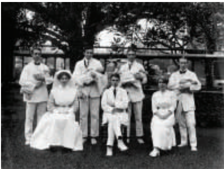
Midwife & medical students early 20th century

This AHRC funded collaborative PhD project draws together the academic expertise of the Department of the History and Philosophy of Science with the experience and collections of the Thackray Museum . The project seeks to discover why the forceps displaced the lever as the midwifery instrument of choice, having been used in parallel with it throughout the nineteenth century.