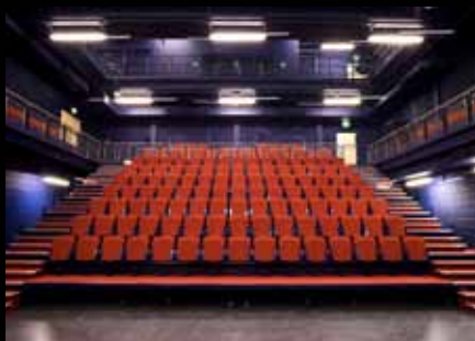
Top: Students outside stage@leeds Middle: stage@leeds exterior Bottom: The 180 seat Stage One Theatre Below: Collaborative work in schools with Opera North

The School has excellent links with many leading UK arts and cultural organisations - for example, Opera North (with whom the University has a formal partnership), West Yorkshire Playhouse, Red Ladder Theatre Company, Limehouse Productions (film), Phoenix Dance Theatre, the National Coal Mining Museum for England and the National Media Museum. These links will allow you to see how your learning can be applied and provide opportunities for you to research and study in professional, creative and cultural contexts.