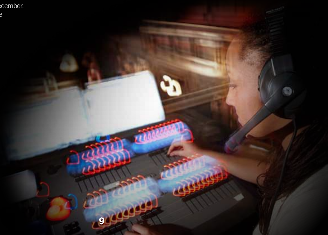
Below: Operating the lighting in performance