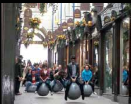
Top: 3D Disco , Leeds University Union Middle: The O2 Academy Bottom: Students 'Flash Mobbing' in central Leeds Below: Leeds – a vibrant city both day and night.

Leeds is the fastest growing city in the UK. With its continued commercial prosperity in areas of finance, business and media, it has great employment potential. This is complemented by an exciting mix of culture, commerce and style, making Leeds a primary social hub of the North. Rich in history with a growing economy and cosmopolitan atmosphere, Leeds remains an affordable student-friendly city and the centre of a region of great cultural diversity.