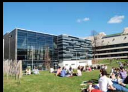
Top: Interior of student study bedroom Middle: Student accommodation, Halls of Residence Bottom: Students outside stage@leeds