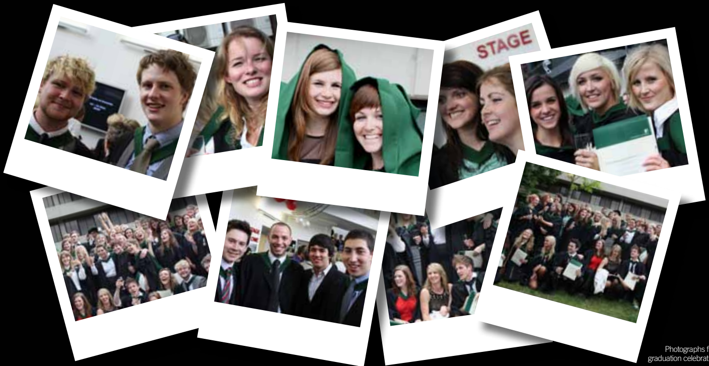
Photographs from graduation celebrations

Here are some comments from our final year students