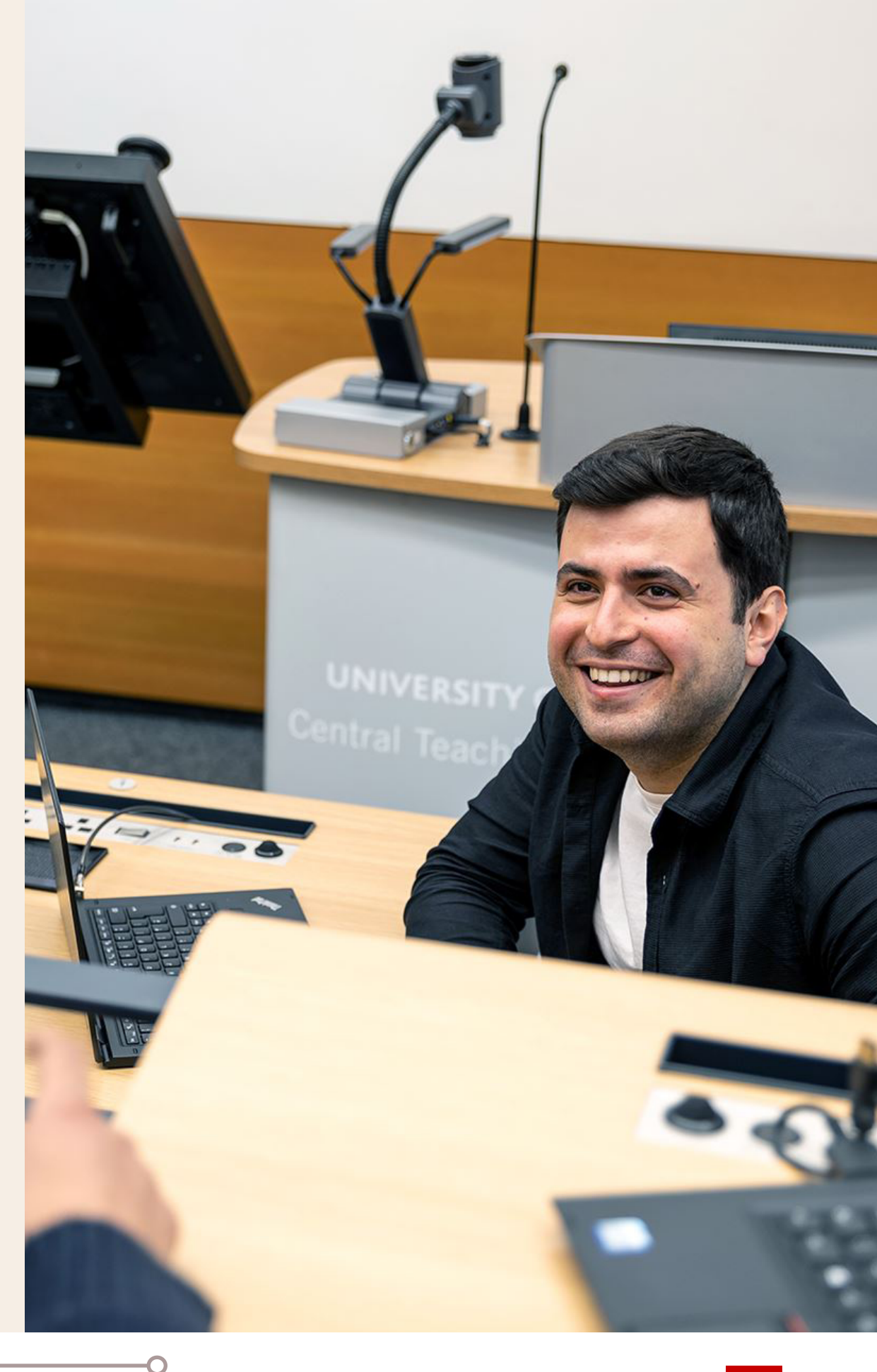
How might we...