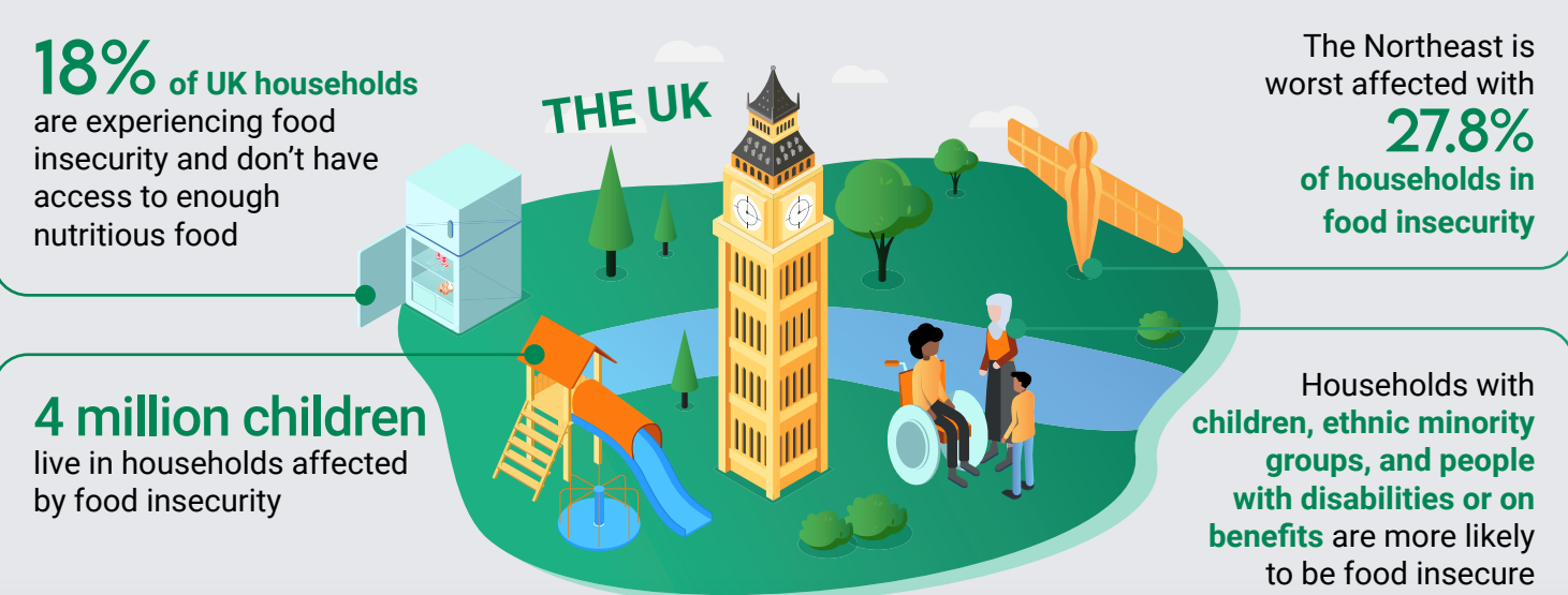
Figure 1: Food insecurity in the UK<sup>1</sup>