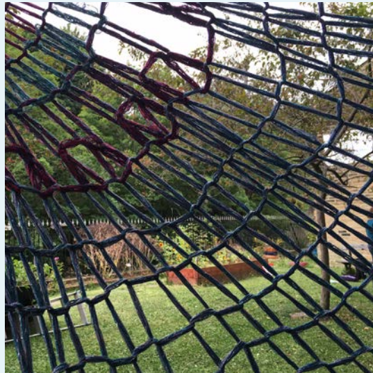
Above: Detail of a community knitted canopy on display at the Colour Garden, Leeds Industrial Museum at Armley Mills

Find out how over two centuries of dyeing expertise in Leeds was uncovered by recreating natural dyes from recipes in Gott's Dyehouse Pattern Book, curated by Heritage Dyers Group.